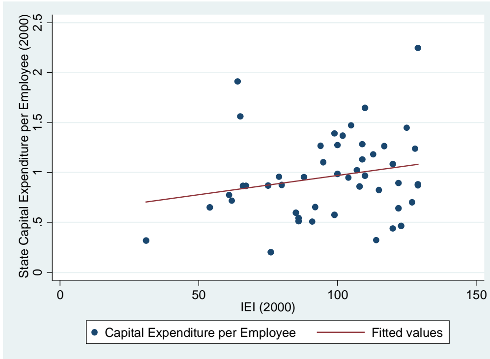
Figure 2 State Capital Expenditure per Employee and IEI (2000)

NOTE: Capital expenditure measured in thousands of 2000 US$. SOURCE: Chirinko and Wilson (2009); Patrick (2014a).