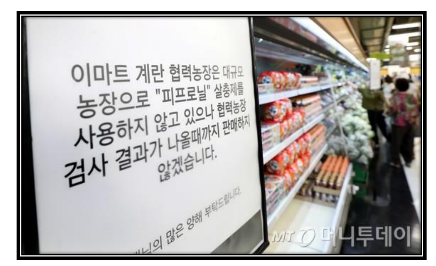
Figure 2. Cessation of Selling Eggs in Supermarkets