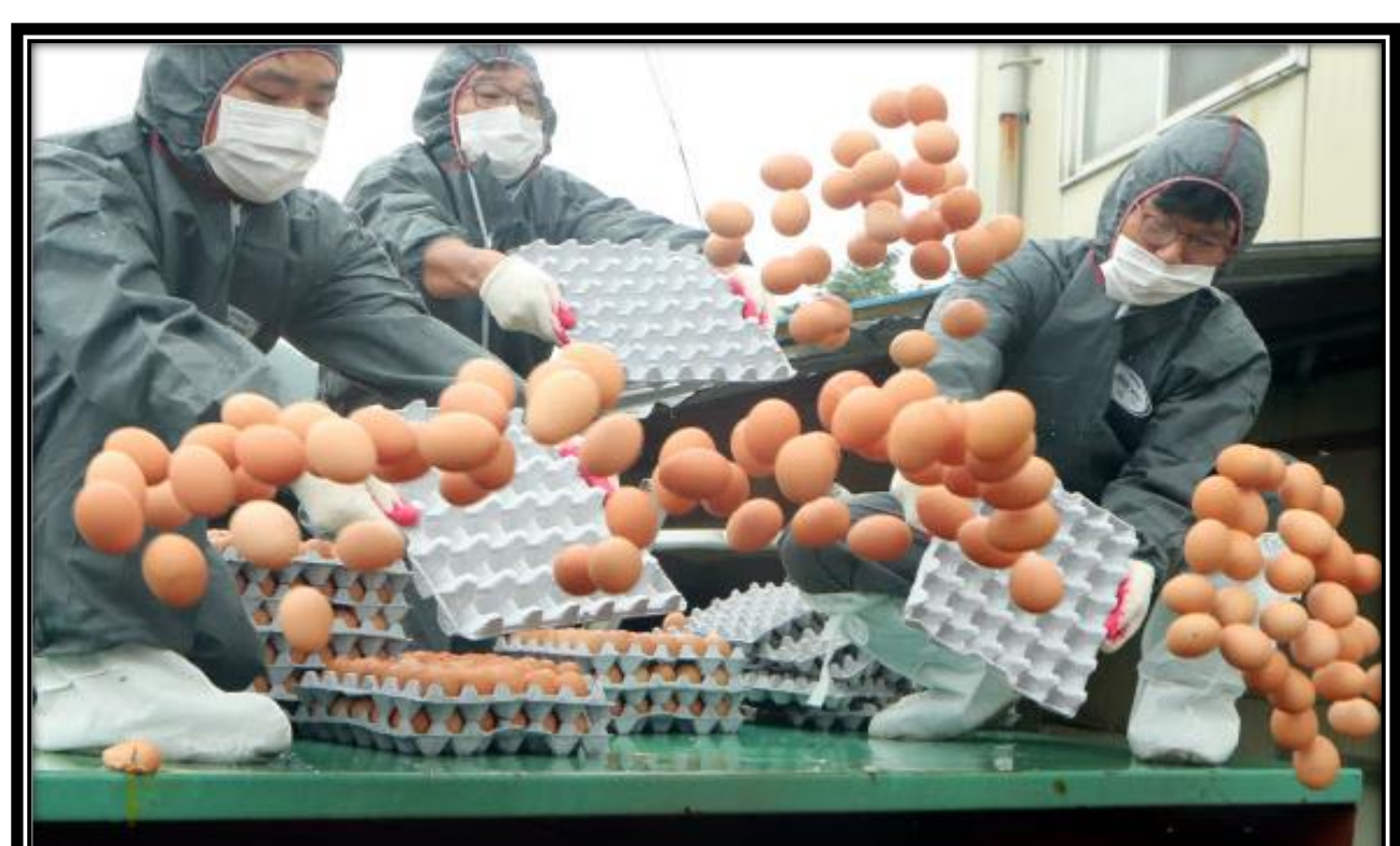
Figure 1. Disposal of Contaminated Eggs

In August 2017, Fipronil contamination delivered a tremendous shock to consumers as well as egg market in South Korea. Major supermarkets stopped selling eggs, and a consumer group seriously casted doubt on food safety.