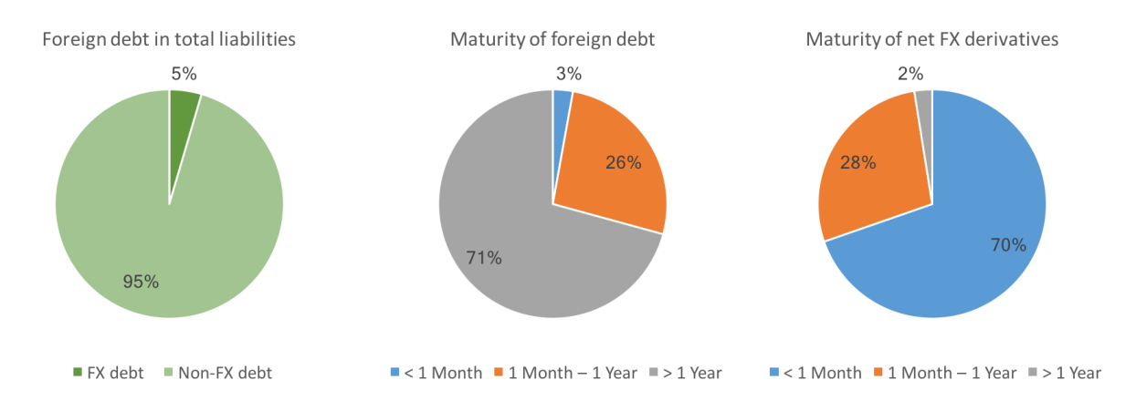
Figure 4: Maturity composition of foreign debt and FX derivatives.