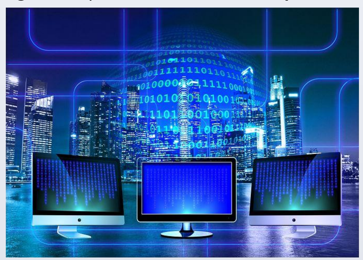
OBJECTIVES OF THE STUDY

The design of these two assignments was motivated by the following objectives: