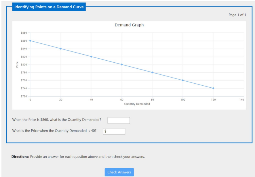
Fig. 4 Screenshot of identifying points on a demand graph interactive tool

students must identify the price associated with a particular quantity demanded value and vice versa. The numbers on the graph are randomized on each iteration, and the points seen each time this tool is loaded are selected randomly from the graph. The “Identifying Points on a Demand Graph” tool helps students understand this foundational skill, which is applied later in the course in the relatively more complex combined supply and demand model.